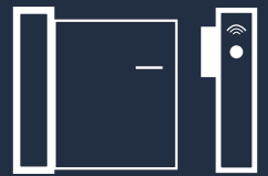
Motorized gates and doors